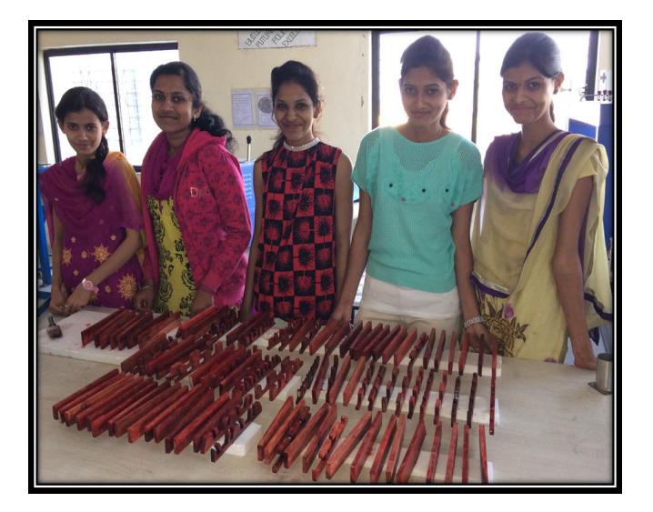
Fig 1. Coloring on Wood

Fabrication of castellated beams is simple series of operations when handling as well as controlling equipment is used. Structural steel is made up by burning two or more section at a same time, depending upon their depth. By using a component of the oxy-acetylene gas cutter equipment, steel section is joined. This equipment is an operated electrically propelled buggy which runs on a fixed track. Castellated steel beams fabricated from standard I-sections have many advantages including self-weight-depth ratio, greater bending rigidity, economic construction and architectural appearance. However, the castellated beams results depending on quality of welding, geometry of the beams and the types of loading condition. Hence the behavior of normal and high strength castellated steel beams under combined buckling modes including web post buckling is also considered in this study.