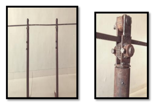
Fig 2 : Mechanical Assembly

The stepper motor which is on the line for the paint rod, is connected with the gear motor timer of the motor to have a exact, safe and appropriate functioning of the painting job.