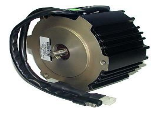
Fig -5: Brushless D.C. motor

Current =10.4 amp Power = Voltage * Current = 24*10.5=250 watt