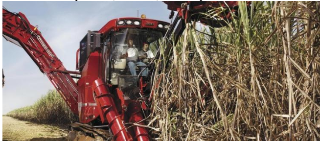
Fig -2: Mechanized Harvesting Method

In mechanization now by using large scale harvesting machine takes about 6-7 hours for harvesting one acre averaging about 70-80 tons with labor costing around 3,500-4,000 Rupees per hour hence the total cost of harvesting per acre comes up to 20,000-25,000 Rupees.