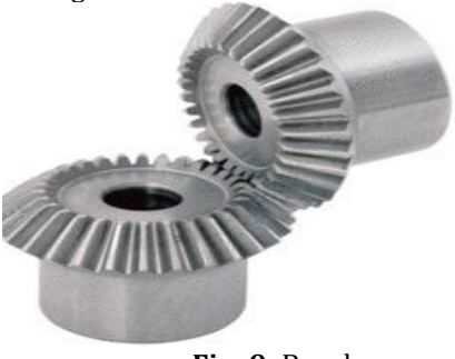
Fig -9: Bevel gear

A pair of bevel gear used to change the motion to 90^{\circ} angle. Bevel gear is used because it can transmit maximum amount of torque through it.