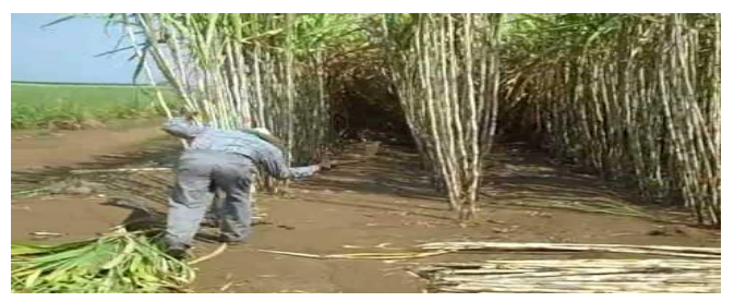
Fig -1: Manual Harvesting Method