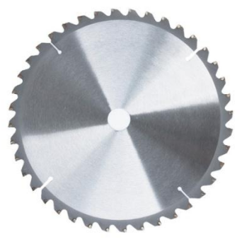
Fig -7: Cutter

Two cutters place at the bottom side to cut the sugarcanes from the stem level. Depending upon the sharpness of the cutters the machine efficiency depends.