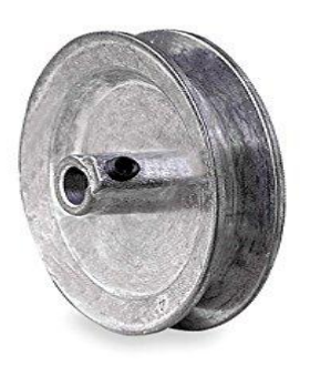
Fig -8: Pulley

Pulley is used to transmit the torque of motor to the cutter. One pulley is directly mounted over the motor shaft and another pulley mounted on the shaft where the motion is to be transferred. And both the pulleys are connected with the help of V-belt.