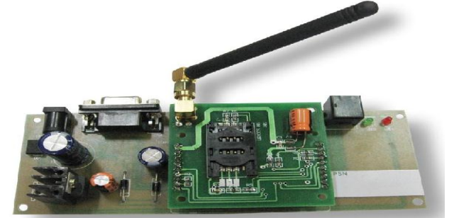
Fig -3: GSM module

This is a modem which is very flexible plug and play quad band GSM modem. It has direct and easy integration to RS232 serial communication. It provides support to various features like Voice, Data, SMS, GPRS and in TCP/IP stack.[11]