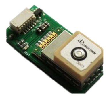
Fig -2: GPS module

An unobstructed line of sight to four or more GPS satellites is required for precise locating. The system has proven critically useful to military, and commercial users around the world. A GPS tracking device accurately calculates geographical location through the information received from GPS satellites. The Global Positioning System is a system consisting of a network of a minimum of 24, but currently 30, satellites orbiting around earth placed by the U.S. Department of Defense.[9][10]