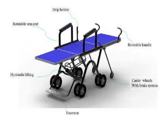
Figure 11.Concept IV

A more strength is given by a double caster wheel mechanism to the design, so that weight of the body can be evenly distributed. Front portion is lifted with the help of hydraulic mechanism so that the patient won't get trouble while lifting.