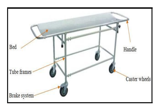
Figure 2. Structure of stretcher