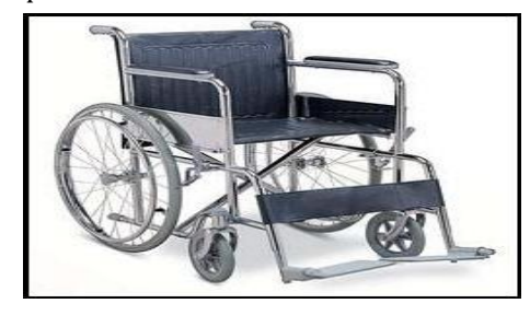
Figure 1. Wheelchair

stretcher also it will be convenient for hospital staff to move a patient, also it will be easy if we provide a electrical system to control the overall movement and functioning of stretcher cum wheelchair. Understanding various issues regarding mobility equipment, the better design will be an asset for medical field and helping hand for disabled individual. The present project proposes a development of wheelchair cum stretcher with ability to transfer patients from normal staircase also with automated electronic control over stretcher cum wheelchair for movement and functioning. Self proceed wheels invention was created enormous demand in the market and it was better helping aid for the disabled individuals.. These will be one of the walking aids which can help with impaired ability to walk using wheelchairs for the disabled peoples.