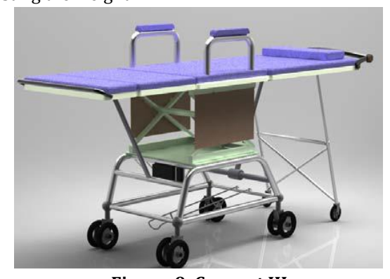
Figure 9. Concept III

This is the concept which is operated with hydraulic mechanism, so that height can be adjusted according to the user's convenience. The user won't get any difficulty while handling the product in such a way that it is designed to handled . A simple design of oxygen cylinder holder is provided below the seat so that it can help to withstand stretcher with a supporting element for adjusting the weight.