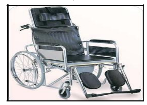
Figure 5. Bench marked product

rest. The product is manufactured with high quality of materials like stainless steel, carbon fiber etc.