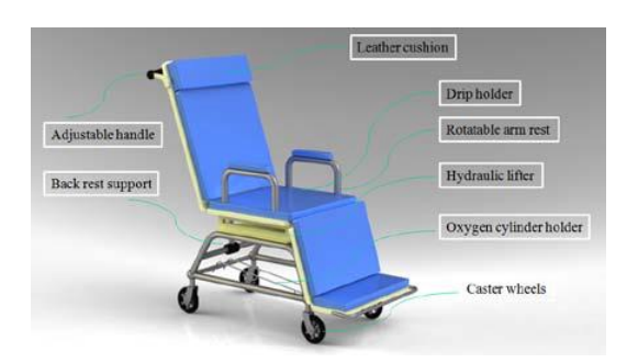
Figure 10. Concept III Wheelchair

The mechanism ,hydraulic scissor lifter lifts the entire wheelchair into stretcher. The telescopic arrangement supports the back rest so that weight of the body will be evenly distributed in the stretcher.