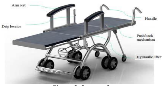
Figure 8. Concept 2

This concept is different from the concept one. The back rest is providing with an adjustable handle with a comfortable holding position. The length can be maintained by adjusting the knob and can be adjusted. The frame design is made in such a way that proper strength is provided to the wheelchair.