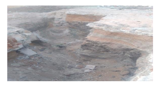
Fig -4.1: Foundation on Rock Stratum