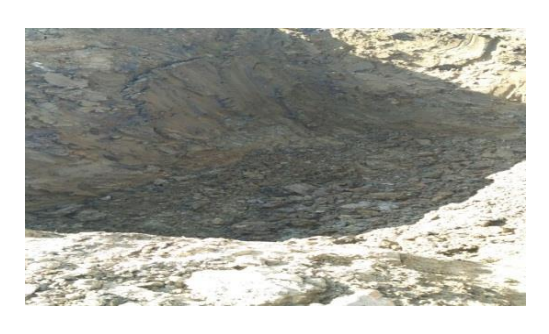
Fig -4.2: Foundation on poor soil (silt/clay)