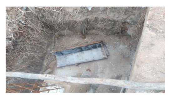
Fig -4.4: Presence of tree roots