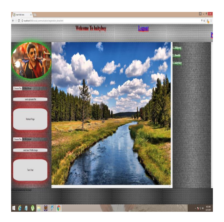
Fig4-Sharing of data

Then that re-encrypted data Stored in cloud database server . From this way we can share and store our data securely.