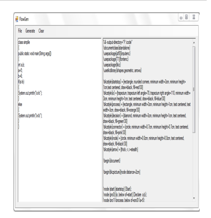
Fig -1: Windows application

This project is implemented so as to reduce the load of manually creating the graphical design. Using our proposed system, this drawback is overcome by automatically generating the graphical design. Conditional statements are easily analyzed because of the use of graphical design. Graphical design generated from a code is useful in case of reverse engineering a software program wherein the user has the code but is need of graphical design for the same. An automatically generated graphical design is also helpful for software testers that are in need of to understand the code; as they have very little time to understand the code by reading it and analyzing each and every statement.