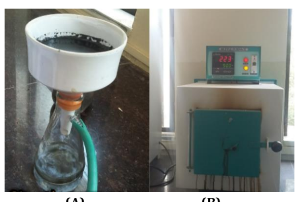
(A) (B) Fig-3 (A): Natural filtration process for carbon content Fig-3 (B): Incineration of rice husk

We use rice husk for experimenting purpose in the laboratory. Rice husk which was burnt in the oven at 500^{\circ} C. Then it was mixed in the mixer for 120 seconds then blackish colour ash is form then it is washed by help of filter using filter paper and distilled water then it is dried at 500^{\circ} C for 2 hrs 100gm ash is mixed with HCL to activate it with the normality of 1:1. Then it is kept at room temperature for 24 hrs to dry it. Again it is washed by distilled water by filtration process and kept in oven at 110^{\circ} C & again it is dried. Activation of ash is completed. Then stock solution is prepared 4.39gm KH<sub>2</sub>PO<sub>4</sub> & distilled water then it is dissolved.