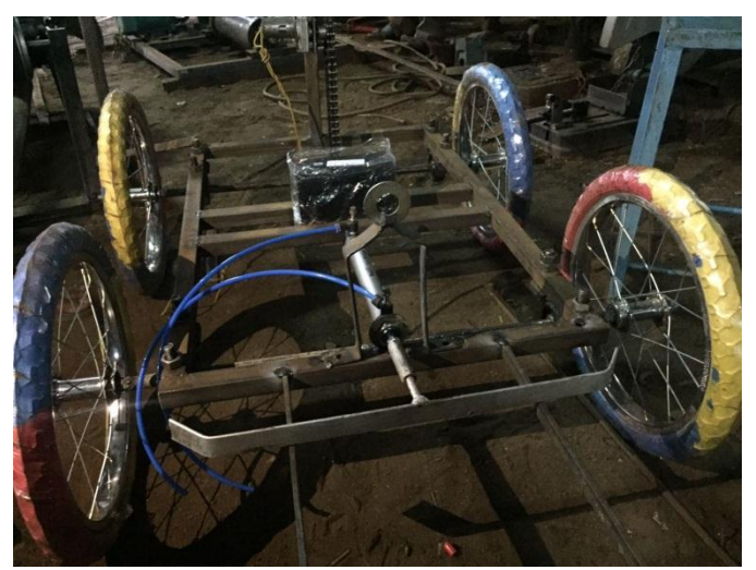
Fig. Final Assembly

All the components are assembled at their proper position. A proper mounting method is used to mount the components. Wiring can be done later.