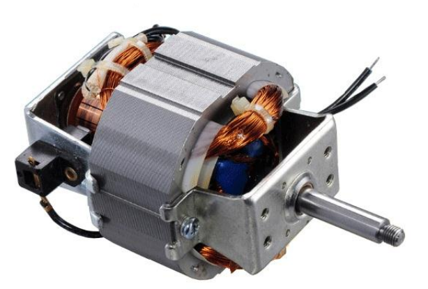
Fig. Electric Motor

An electric motor is an electrical machine that converts electrical energy into mechanical energy. Electric motors are used to produce linear or rotary force (torque).