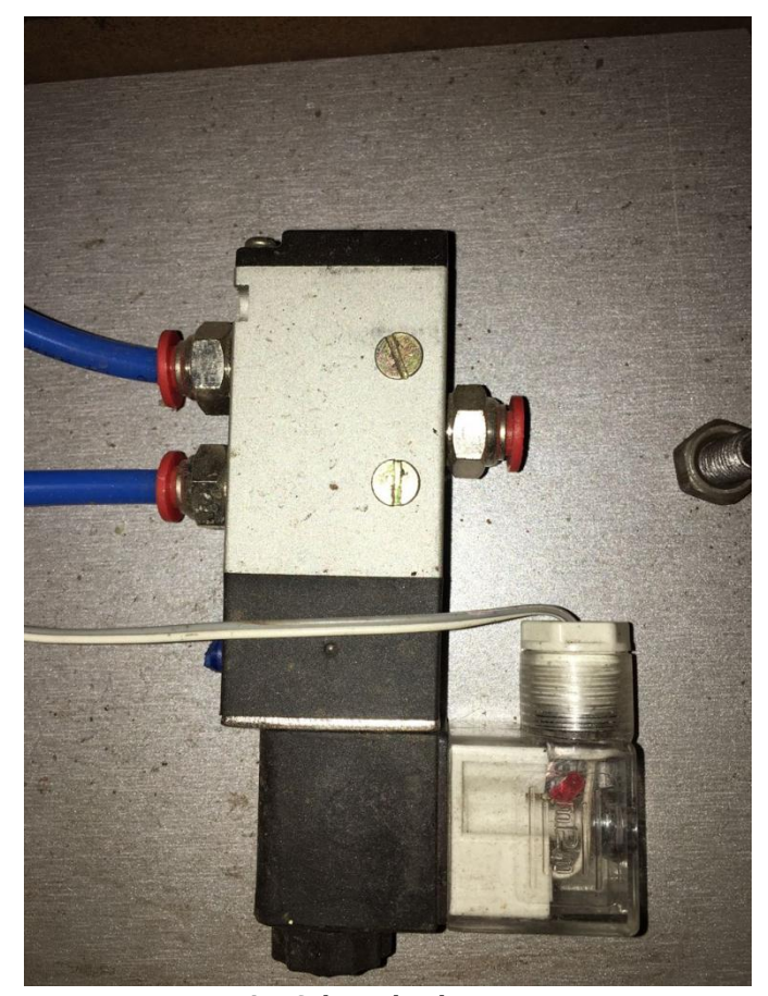
Fig. Solenoid Valve