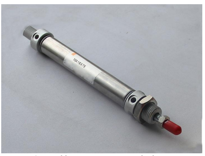
Fig. Double acting pneumatic cylinder

strokes. The air from the compressor is passed through the solenoid valve which controls the pressure to the required amount by adjusting its knob.