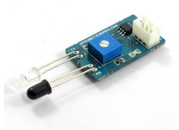
Fig. IR Sensors

This unit consists of two components : IR Receiver and IR Transmitter.