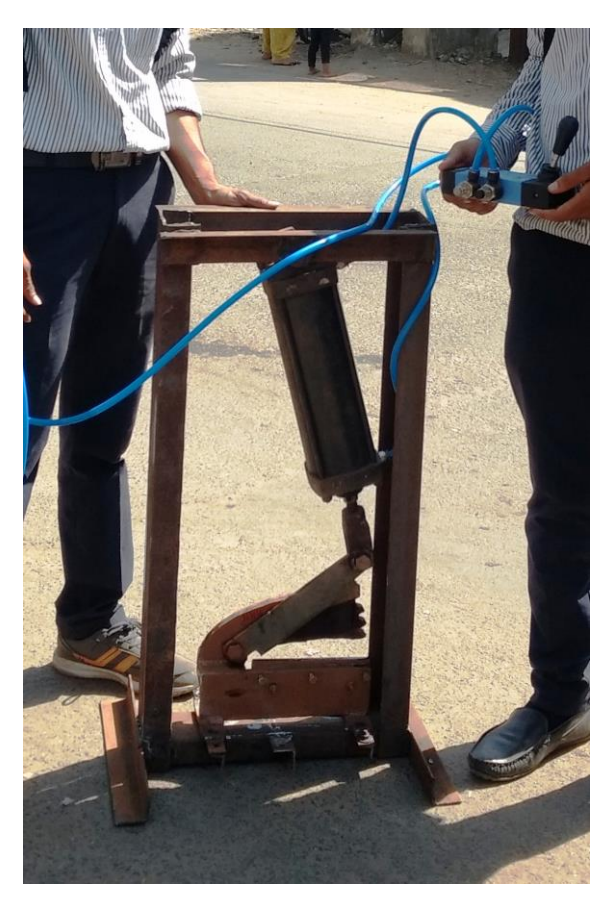
Fig-1: ACTUAL MODEL OF PNEUMATIC SHEET METAL CUTTING AND BENDING MACHINE