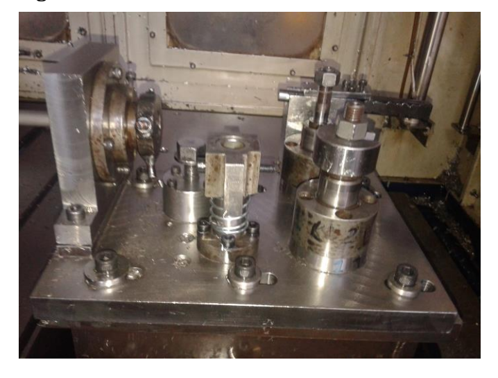
Figure -4: Fabricated Model