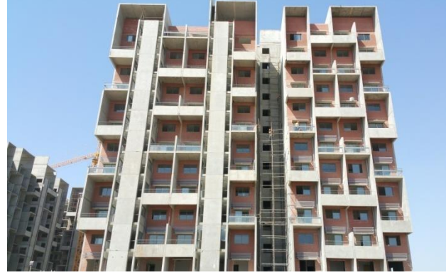
Figure 4 :- E1 Building in finishing stage

10. RCC consultants: JW Consultants, Pune.