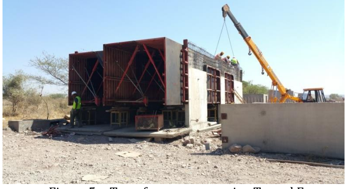
Figure 5 :- Transformer room using Tunnel Form

Heavy machinery and on site management are critical factors in implementing tunnel formwork. Also high cash flow management is essential to carry out work properly. Coordination problem cause remarkable delay in schedule. Also after studying the tunnel formwork system it can be concluded that, though initial investment and per day operational cost in TUNNEL formwork is more, due to more reuses and reduced slab cycle time TUNNEL formwork works out ultimately economical. Also returns from initial investment regained due rapid completion of project Hence in long term consideration TUNNEL formwork system is beneficial. As turnover is more within a short period, returns of investment made will be early. And hence when considered for longer period of time over large area, tunnel formwork works out to be economical.