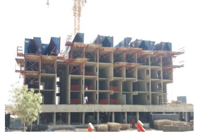
Figure 3 :- E1 Building During Tunnel Casting

with fabulous architecture view after erection at very short period of time which again results in time and cost saving.