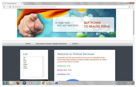
Fig. 2: Rating of the forum depending on the comments.

As shown in Fig1 the user can create any political Forum according to its choice.