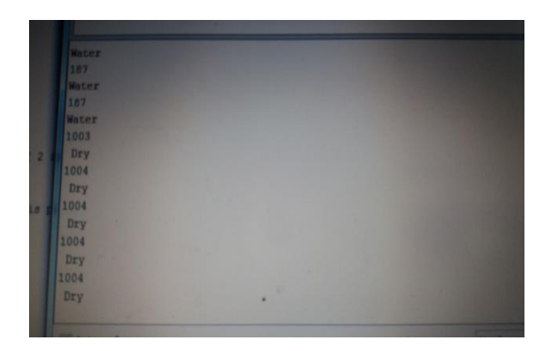
Fig -3 : Output from soil moisture, can be displayed through LCD at site.