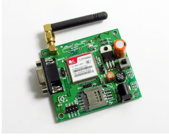
Fig-: GSM Module

GSM is a technology that is used for voice communication and for data communication. It is a digital technology. GSM needs base transceiver station module to communicate with the mobile device. The mobile device can change base transceiver station based on coverage and capacity. GSM operates in different frequencies band, 900 MHz and 1800 MHz allocate for GSM communications and Canada use 850 MHz and 1900 MHz for GSM. First, generation GSM used 400 MHz and 450Mhz. GSM contains Technologies like TDMA-Time Division Multiple Access. This technology is used widely, compares to CDMA.