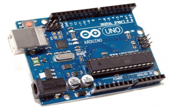
Fig -1: Arduino Board

Arduino is an open-source prototyping platform based on easy-to-use hardware and software. Arduino boards are able to read inputs - light on a sensor, a finger on a button, or a Twitter message - and turn it into an output - activating a motor, turning on an LED, publishing something online. We can tell board what to do by sending a set of instructions to the microcontroller on the board. To do so we use the Arduino programming language (based on wiring), and the Arduino Software (IDE), based on Processing.