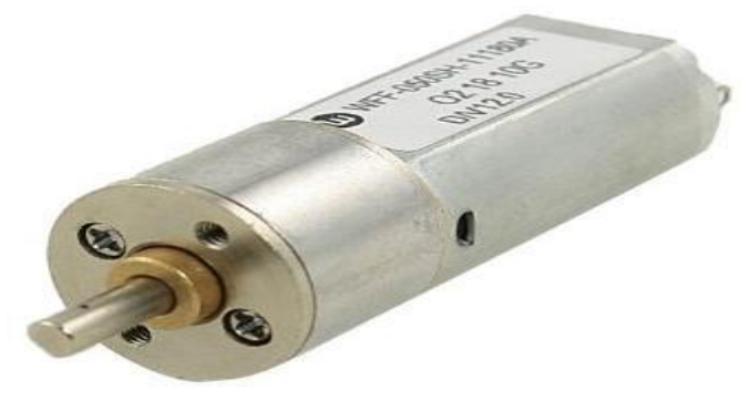
Fig -6 Motor Driver

Because of very low current requirement, these motors can easily operate with small batteries and solar panels. Quiet and smooth operation of this motor makes it a perfect choice for indoor and long hours of operation. Direction of rotation: Counter-Clockwise when viewing from the output shaft end with positive voltage applied to positive terminal.