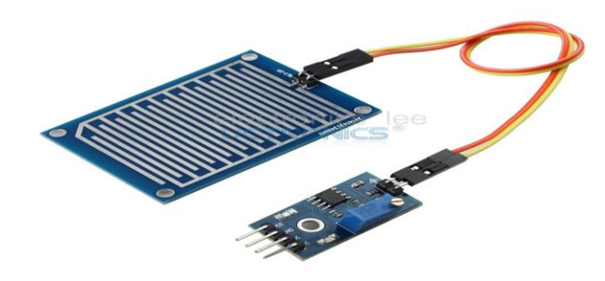
Fig -2: Rain Sensor

The rain sensor module is an easy tool for rain detection. It can be used as a switch when raindrop falls through the raining board and it can also be used for measuring rainfall intensity. The module features, a rain board and the control board that is separate provides much more convenience with a power indicator LED and an adjustable sensitivity though a potentiometer.