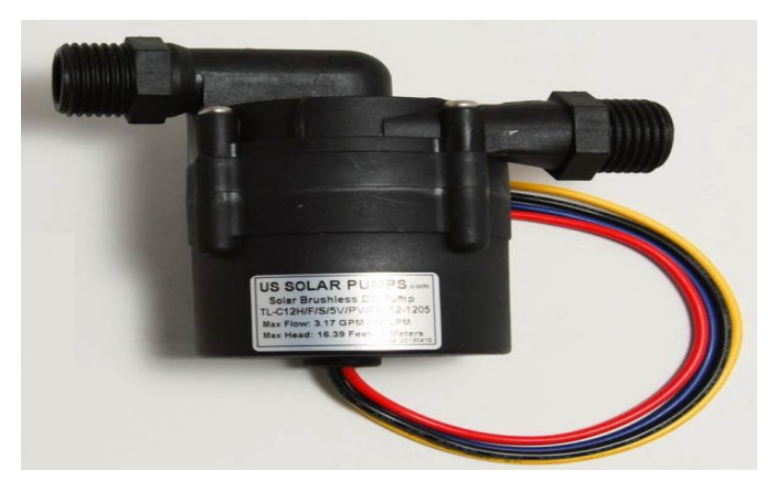
Fig -5: Water Pump

The water pump is used to artificially supply water for a particular task. It can be electronically controlled by interfacing it to a microcontroller. It can be triggered ON/OFF by sending signals as required. The process of artificially supplying water is known as pumping. There are many varieties of water pumps used. This project employs the use of a small water pump which is connected to a H-Bridge.