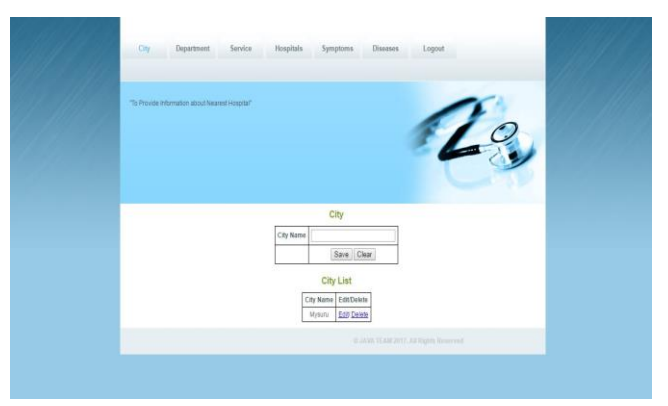
Fig-2: Web Application for Administrator

employed in this paper to design the web based application for administrator is Java Enterprise Edition (J2EE), it is a platform independent Java centric environment which can be used as a server side application and also offers several services for developing and deploying web based applications. Some of the services used here is Java Server Page (JSP), Java script (JS), Java Database Connector (JDBC), and Java Beans.