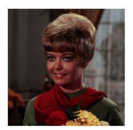
Fig -2: After algorithm