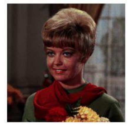
Figure 1 and 2 show outputs before and after execution of our proposed algorithm. It can be seen that there is hardly any visual difference to the naked eye thus showing how good the algorithm is.

The proposed algorithm can be seen to perform almost as good as LSB both in terms of PSNR and time of execution. However the security of the proposed approach is better. Given that the security of the proposed approach is better it can be said that the proposed approach is better than LSB.