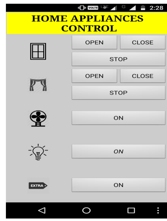
Fig -2: Android Application GUI

To build the android application we used the MIT app inventor that is online android application development tool provided by Google. For each appliance we use one button for turning ON/OFF the appliance, after clicking the button it will automatically get toggle. Commands are sent through the webviewer object to the Wi-Fi module. Webviewer passes the commands through the address of Wi-Fi Network.