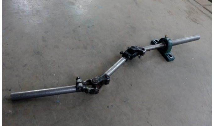
Fig no. 2: Main Shaft

The shaft has two universal joints to compensate for the angular movement when the shaft swivels.