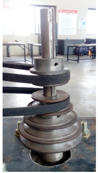
Fig no 3: Pulley

The upper side of the shaft is connected to the pedestal bearing. Due to the bearings have hole of 17mm; we make a small portion of 16.9-16.95mm on shaft to fit in the bearing since the bearing has small tolerance. Four speed pulley is attached at one end of the shaft. The other pulley is mounted on the motor shaft. A V-belt is provided which takes care of power transmission.