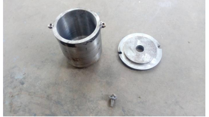
Fig no 1: Voil

For our experiment, we used EN8 (Carbon 0.36-0.44%, Silicon 0.10-0.40%, Manganese 0.60-1.00%, Sulphur 0.050 Max, Phosphorus 0.050%) as our grinding media and grinding jar. For the jar, inner diameter of 100 mm and thickness of 10 mm is chosen as our design. The jar has approximately 8.1627 \times 10^{-4} m<sup>3</sup> of volume and it can withstand 4.4021 \times 10^{-4} m<sup>3</sup> of grinding media. The voil (grinding jar) cap has an arrangement that clamps itself with voil. The voil cap has an opening for the shaft. The shaft of diameter 25.4 mm is inserted through this opening. The blades are attached to the shaft with the help of grab screw. For grinding media, 5mm and 10mm diameter of stainless steel balls are used. For our shafts, we used the mild steel provided in store and went to labs for machining purpose.