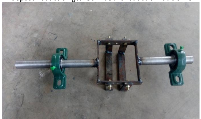
Fig no 4: Voil Handle

about 60 mm motor drives another pulley. This pulley is directly connected to the shaft of speed reduction gearbox. The speed reduction gearbox has the reduction ratio of 15:1.