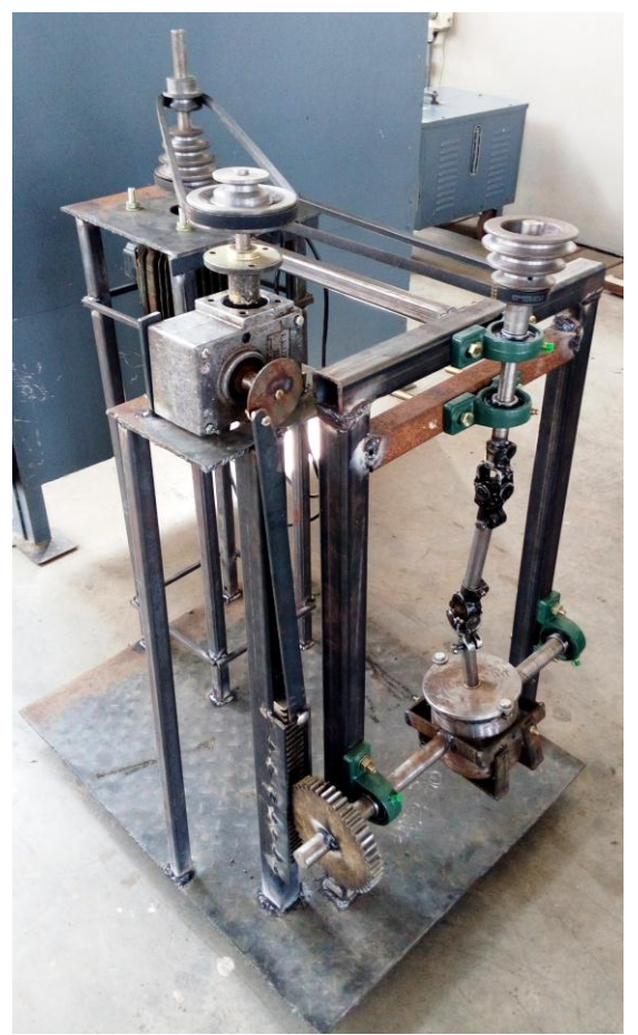
Fig no 5: Machine

The drive from the speed reduction gearbox is given to the voil through rack and pinion. The rack and pinion is used to provide to and fro motion to the voil. The rack is placed on the voil handle. The voil handle is designed for easy removal of voil whenever required. Bearing are provided at each side for proper functioning. These bearings are attached to main frame which is made up of M.S square bar 1.5*1.5 inches in cross section.