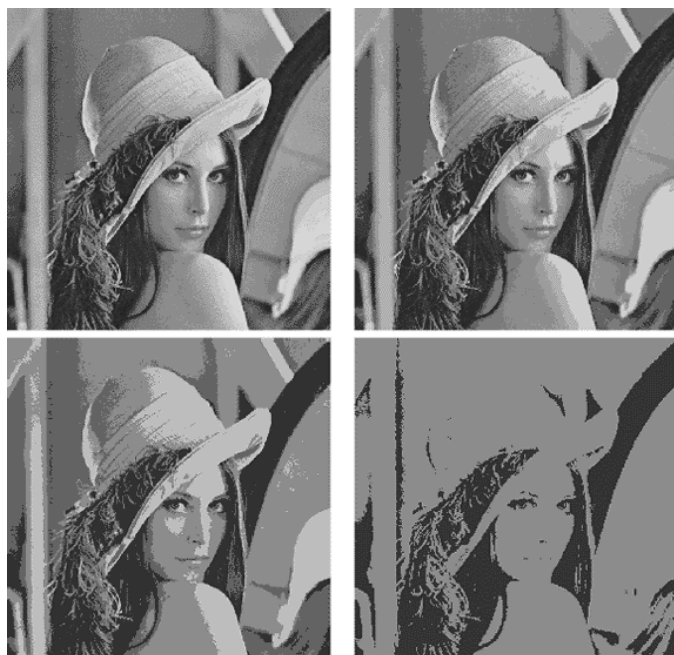
Fig-2 Quantization of Image

Quantization is the simple technique in which compression of a range of values to a single value takes place. The stream becomes more compressible if a discrete symbol in a given stream is reduced. In color quantization, the number of colors used in image is reduced. This is required if devices are not capable of displaying images with large number of colors. Popular examples of color quantization algorithms includes median cut algorithm, nearest color algorithm etc.