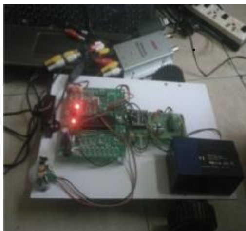
Figure 2: The Prototype of the proposed system

To test the functioning of the robot, it was equipped with sensors and a low quality camera. The keypad provided in the transmitter was pressed to navigate the robot in all directions. Many obstacles were placed along its path. When the robot confronted the obstacle, IR sensor sensed the obstacle. The robot automatically stopped. To test the working of PIR sensor in the proposed system, human motion was introduced in its path. On sensing the motion, the robot stopped. When heated iron rod was placed in the vicinity of the moving robot, the robot automatically stopped. The temperature sensor is activated when the temperature exceeds the calibrated temperature.