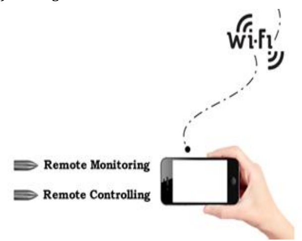
Fig -3: Working Module 3

In this module, there are 2 concepts described.