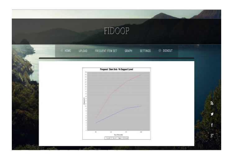
Fig.5.3 Frequent Itemsets vs Support Level

International Research Journal of Engineering and Technology (IRJET)e-ISSN: 2395 -0056IRJETVolume: 04 Issue: 05 | May -2017www.irjet.netp-ISSN: 2395-0072