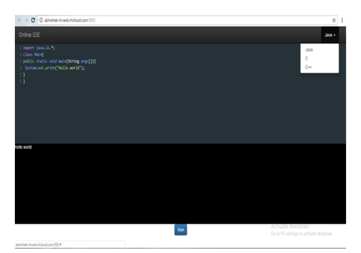
Fig-2: Online Compiler

Online Compiler provides the facility such that the same source code can be compiled and run in multiple programming languages. The user first creates a text editor for creation and correction of program files. This helps in creating simple front end which is platform independent and load files quickly. Assemblies can be generated dynamically during runtime. Now the text area is made to check whether it is empty or not. Use CompileParameterClass for invoking compiler parameters, CompileErrorClass for showing errors details and CompileResultClass for implementation of compilation process.