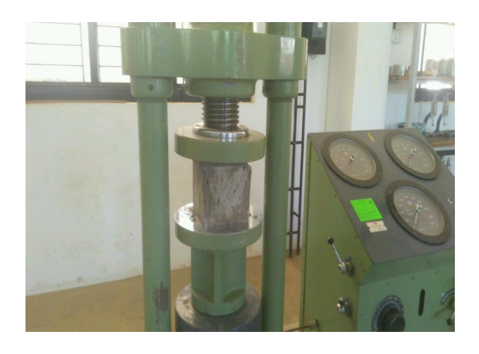
Fig -1: Test setup for cube compressive strength