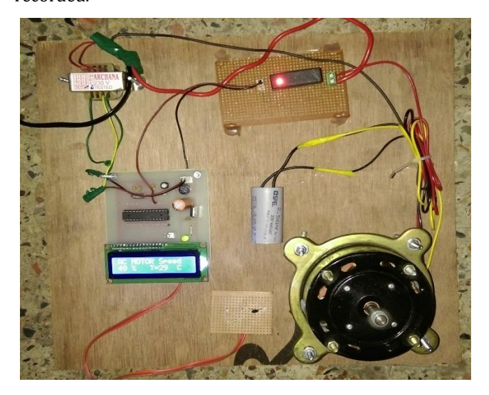
Fig -3: Working model of speed control of 230v ac Motor using thermistor

The speed of the motor gets increase as the temperature of the surrounding increases and vice versa. The characteristics of temperature and speed is being recorded.