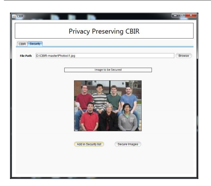
Fig 8.5: Security to particular image