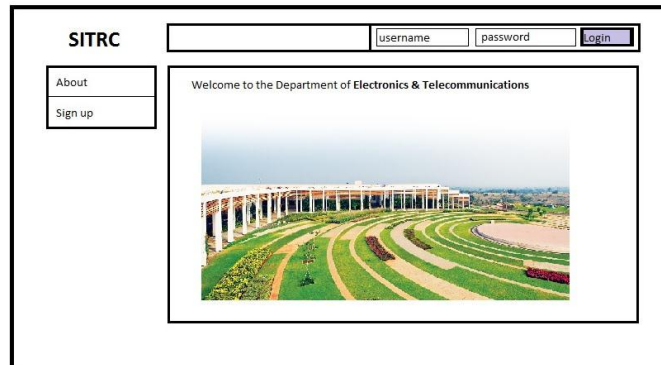
Fig. - 2: Login Page of Website

The Server end deals with Server hosting the web pages. Since, this is a Dynamic Website; a Server should be capable of handling User requests. PHP programming language will be used to script and code the Server [5-8].