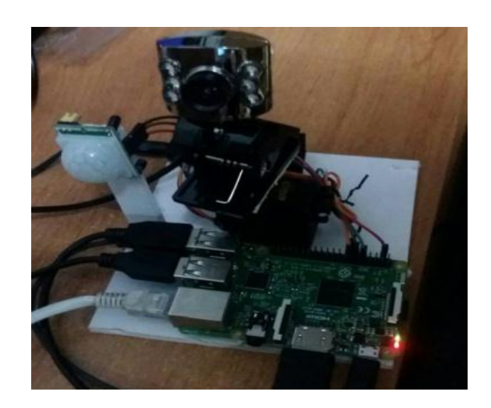
Fig -2: Raspberry Pi Installation Setup

Since Google maintains many projects, each project is given a specific project ID and under each project many devices are registered with unique device ID. Google sends unique device ID i.e., FCM Token to the user's Email ID, that token has to be copied in to the FCM token list, this procedure completes the registration phase. Admin also maintains data set of device ID, project ID and certificate details.