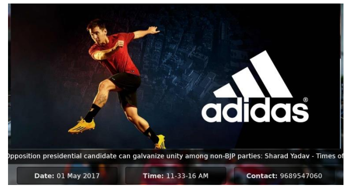
Fig -5: Advertisement Board

The front-end of the digital signage board will be a advertisement slideshow along with the traffic dashboard being displayed after every 3rd advertisement for a finite duration of time .The requests such as change time interval of the advertisements, time interval for traffic dashboard. location update for traffic data is being accepted on the control panel webpage and is passed on to the server. Server then updates the required variables and passes the value to the traffic dashboard. The passing of values from one webpage to another webpage becomes easy with the use of web servers.Figure-5 shows the advertisement display on the signage board.