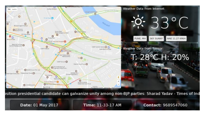
Fig -4: Traffic Dashboard

Figure-3 shows the screenshot of the control panel used in the back end of the digital signage board. We can also observe the current displaying advertisements in the control panel. The Control panel can be accessed by any device connected to the internet only with valid login credentials. The Figure-4 shows the real time traffic dashboard along with live traffic conditions as well as weather updates with current city news in the footer.