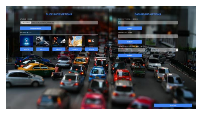
Fig -3: Control Panel

The Sensor is calibrated to read values after every 10 seconds as initially it requires to attain thermal equilibrium state to sense accurate temperature and humidity.