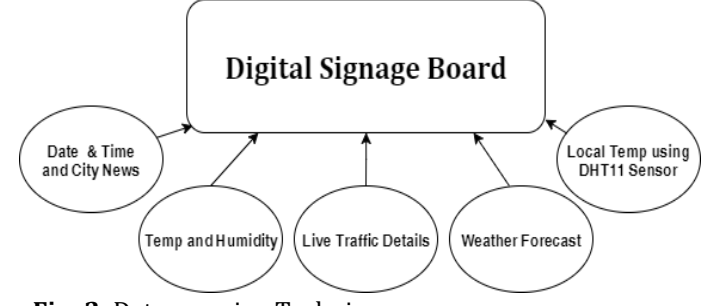
Fig -2: Data scraping Techniques

The front-end development is done using HTML5 and CSS. CSS is used in this study to customize the front-end. CSS; in other words Cascading Style Sheet defines how to display HTML elements [6]. Cascading Style Sheets customize fonts, colors, margins, lines, height, width, background images, advanced positions and many other things. CSS gives us the advantage of controlling the layout of multiple documents from a single style sheet.