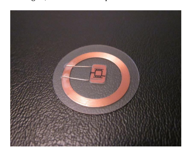
Fig.3 NFC tag

NFC tags are passive devices which means that they operate without a power supply of their own and are reliant on an active device to come into range before they are activated. The trade-off here is that these devices can't really do any processing of their own instead they are simply used to transfer information to an active device, such as a smartphone. In order to power these NFC tags, electromagnetic induction is used to create a current in the passive device. We won't get too technical on this, but the basic principle is that coils of wire can be used to produce electromagnetic waves, which can then be picked up and turned back into current by a another coil of wire. This is very similar to the techniques used for wireless charging technologies, albeit much less powerful.