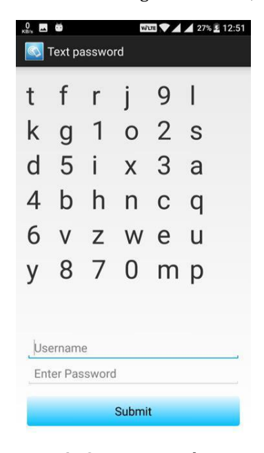
Fig.2 Matrix Window

When the NFC tag authentication is done by the user, then user login into system . The next tab is matrix authentication level. Following is the Matrix,