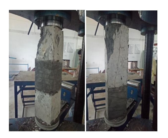
Columns wrapped with SSWM

For the control column the compression failure was observed. In fully wrapped columns no major failure patterns where visible on the surface of columns. In partially wrapped columns, the failure is observed in the area where both SSWM and GFRP is not wrapped. The columns which partially wrapped at top and bottom layer the failure is observed at the opposite edges. The columns partially wrapped at middle layer in both SSWM and GFRP, failure occurs at top of the column.