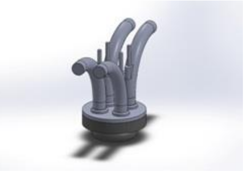
Fig 4. Isometric view of assembly of valves, piston, intake manifold and combustion chamber.