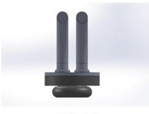
Fig 3. Side view of assembly of valves, piston, intake manifold and combustion chamber.