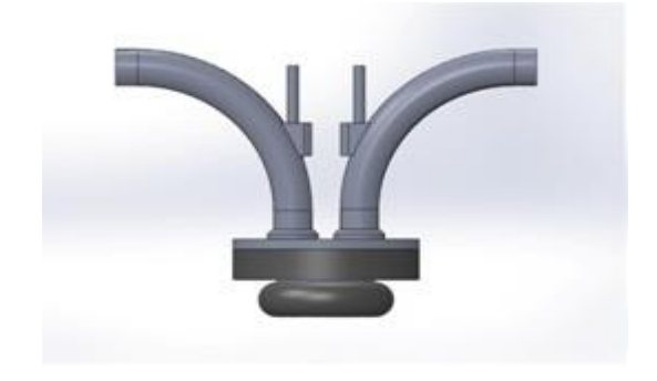
Fig 1. Front view of assembly of valves, piston, intake manifold and combustion chamber.