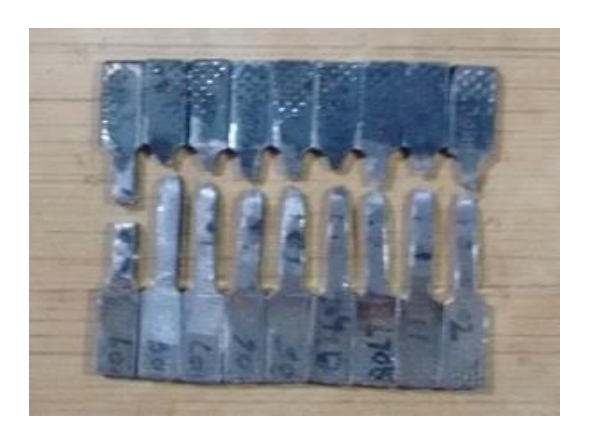
Fig-2:- Specimens After Tensile Test.