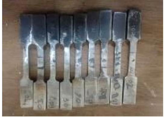
Fig-1:- Specimens Before Tensile Test.

Tensile test is used to determine the tensile strength of the welded joint of Austenitic Stainless Steel (AISI 316) and Mild Steel. The test is conducted on Universal Testing Machine (UTM) and the result is shown in table-6.