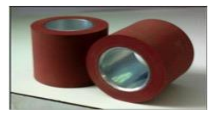
Fig.4 Rubber cots with and without deburring

Sachianand Vishwakarma et al [6] 2014 has mentioned that The objective of this paper is to deliver a predispose about an automated & system integrated machine named as 'Cot Chamfering Machine' with the help of the data obtained by thorough research and development techniques. The subsequent machine contributes to the precise delivery of sophisticated chamfering operation performed on a part named 'Rubber Cot', which is primarily used in textile industries. This prescriptive paper offers genuine concepts & overview of the research and development done on the respective machine along with the basic introduction about the same. The machine has the huge scope for development as it is being an automated & system integrated machine and the same has been portrayed in the paper.