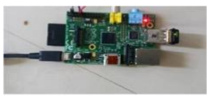
Fig. 5 Arduino input method

Venkatesh Neelapala et al [9] 2015 says that Now-a-days air pollution is increasing rapidly due to growing cities, industrialization and higher levels of energy consumption leading to global warming and acid rains. To avoid such effects an efficient environment monitoring system is necessary. In this paper, an online environment monitoring system based on wireless sensor network using X-bee and open source hardware platforms, arduino and Raspberry pi is implemented.