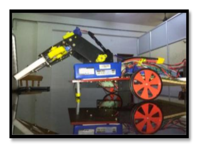
Fig -2: Smart Robotic Assistant

International Research Journal of Engineering and Technology (IRJET)e-ISSN: 2395 -0056Volume: 04 Issue: 06 | June -2017www.irjet.netp-ISSN: 2395-0072