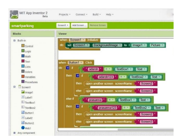
Fig -2: MIT App Inventor

An android application is developed using the MIT App Inventor.