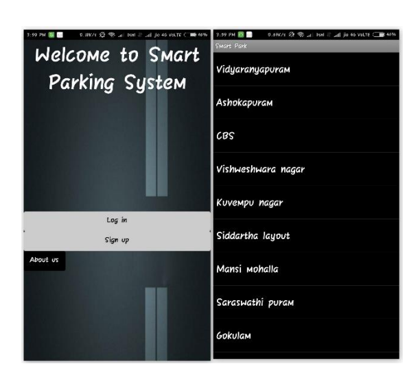
Fig -3: Android application

At the user end, the user registers himself with the system by giving all relevant credentials. Once registered they are free to log into android app to view free parking slots in their area of interest. By convention all occupied slots are indicated in red, unoccupied slots in green and reserved slots in blue color. User can reserve an unoccupied parking slot. Cancellation of the reserved parking slots can also be done using android app.