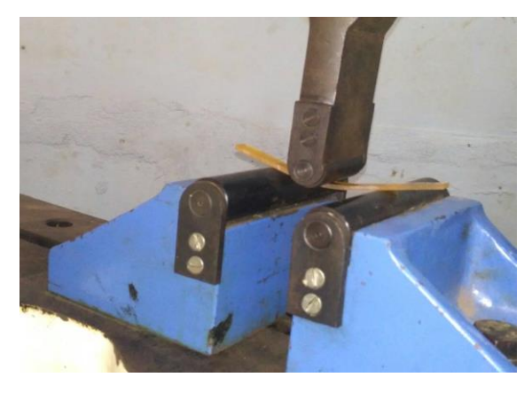
Fig - 2 Specimen loaded for testing

Where F is the load applied in N, L is the span length in mm, b is the width in mm, h is the thickness in mm, and d is the deflection of the specimen in mm.