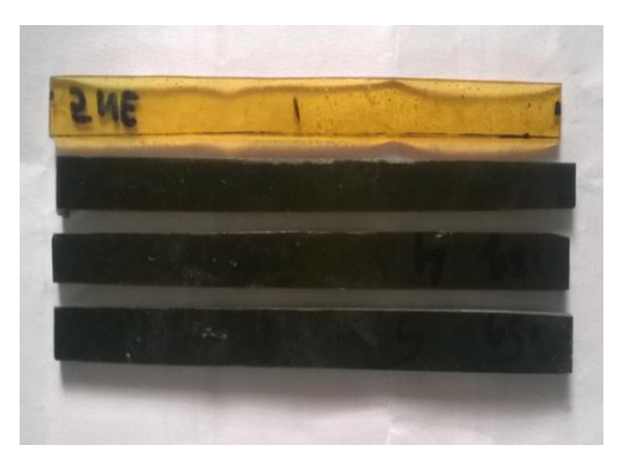
Fig - 1 Samples prepared for testing

Composite specimens were prepared by using hand layup method. Four different types of composite specimens were prepared with 0.00%, 0.1%, 0.3%, and 0.5% weight percentage of Graphene as the reinforcement. Composite slabs were cured for about 24 hours at room temperature and then removed from the mould. Cured composites were further cut in required dimension with the help of HITACHI PDA 100D Hand cutting machine available at Gogte Institute of Technology, Belgaum. These specimens were used for three point bending test.