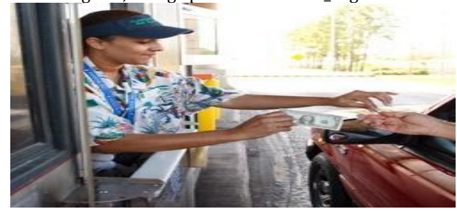
Fig 1: Manual Toll collection

The authority, who additionally apportions change, may acknowledge and offer scrip, tickets, coupons, making a passage of the vehicle in the framework and issuing receipt to the supporter. Because of manual mediation, the processing time is highest, change problem is there. _ Fig 1: