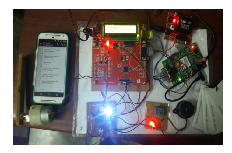
Fig 4: Output of Proposed model

When we turn on the power supply, it LCD display gives "Waiting for Vehicle". Then we need to show the RFID tag to RFID reader module to get the details of the vehicle and it detects the required amount from authorized person bank account and also it sends a message to owner mobile number using GSM SIM900a. It also automatically updated in webpage using GPRS. If any theft vehicle was found the toll gate cannot opened and also it sends SMS to authorized persons. This figure is shown below