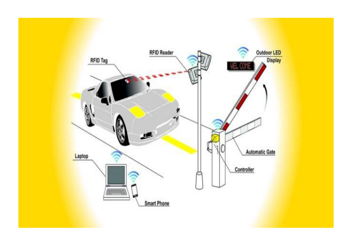
Fig 2: Automatic Toll collection

Volume: 04 Issue: 06 | June-2017 www.irjet.net p-ISSN: 2395-0072