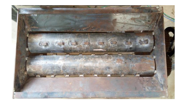
Fig 3 crushing drums