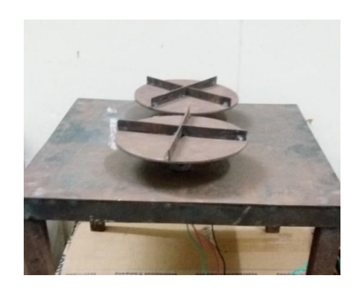
Fig 2 5v dc motors with coin dispersive mechanism

Two DC - Motors of 5v are used for coin dis pensive mechanism. The motors are programmed to rotate 90 degree for one signal from the microcontroller.