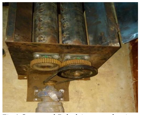
Fig 1 Gears and Belt driven mechanism

In the operation of crushing there are two rollers which are rotating in opposite direction. These rollers are driven by gears; the rollers are attached with gears at the one end of the shaft. Both rollers are driven at the right end. Out of two rollers one roller is directly connected to the driven shaft through belt; and two gears of same diameter and same number of teeth's. The two rollers should rotate in opposite direction in order to crush the bottle, to perform this action the gears are meshed externally as shown in figure 1