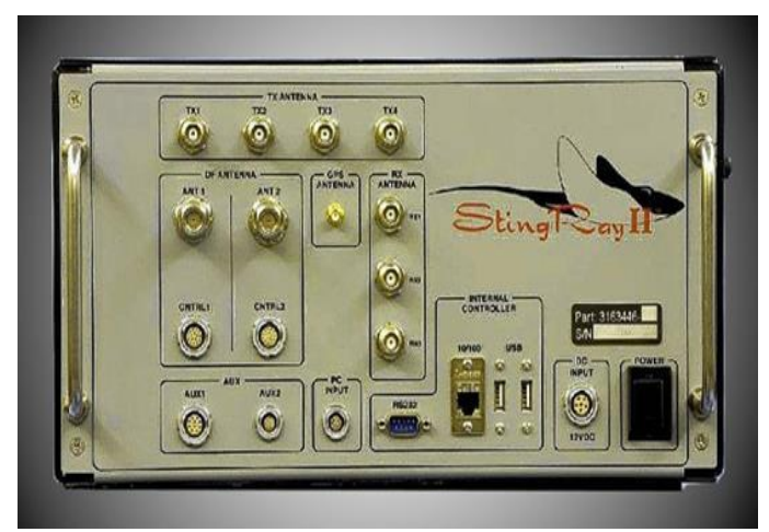
Fig -1: Stingray

Stingray: A suitcase size device act as a take cell tower. System installed in the vehicle so that, it can be moved anywhere tricks all nearby phones into connecting to it and feeding data to police. The Stingray is an IMSI-catcher with both passive (digital analyzer) and active (cell site simulator) capabilities. [1]