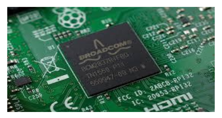
Fig -4: Broadcom BCM-2837 processor chip.

This is the Broadcom chip used in the Raspberry Pi 3, and in later models of the Raspberry Pi 2. The underlying architecture of the BCM2837 is identical to the BCM2836. The only significant difference is the replacement of the ARMv7 quad core cluster with a quad-core ARM Cortex A53 (ARMv8) cluster.