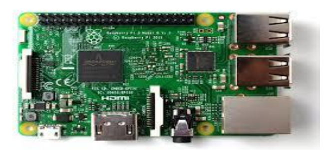
Fig -3: Raspberry Pi-3 Model B

The Raspberry Pi 3 Model B is out now. This latest model includes 802.11n Wi-Fi, Bluetooth 4.0, and a guad-core 64bit ARM Cortex A53 running at 1.2 GHz. It's a usable desktop computer. News of the latest Raspberry Pi swept around the Internet like wildfire this last weekend, thanks to published FCC docs showing a Pi with on-board Wi-Fi and Bluetooth. While we thank the dozens of Hack day readers that wrote in to tell us about the leaked FCC documents, our lips have been sealed until now. We've been doing a few hands-on tests with the Pi 3 for about two weeks now, and the reality of the Pi 3 is much cooler than a few leaked FCC docs will tell you. This is a very special year for the Raspberry Pi foundation. Because the foundation was founded on February 29th 2012, today is technically their first birthday, or at least that's the cheeky line they're telling everyone. With this anniversary, celebrations are in order and a new model of the Raspberry Pi has been announced.