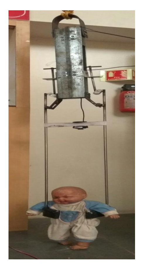
Fig-2.1: Fabricated child rescue mechanism

The fabricated mechanism is as shown below. It consists of threaded shaft with a nut. The threaded shaft is connected to the motor from the upper end. The motor is connected to 12 V DC battery which when operated causes the threaded shaft to rotate. When the motor rotates, the nut moves upwards and downwards depending on the direction of rotation which in turn causes the lower link to extend and retract.