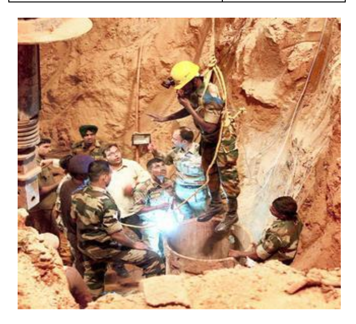
Fig-1.1: Traditional rescue method of child from bore wells