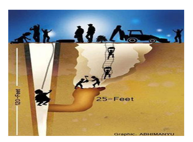
Fig-1.2: Digging of parallel well for rescue