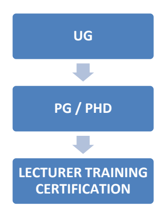
Fig- 4.1: Qualification of a Teacher

The teachers have to identify the gaps in their teaching-learning process and implement effective teaching pedagogy. It is imminent to explore ways to reflect the value of teacher education in technical skills training, renovating training results, making teachers actively apply the knowledge and skills learned.