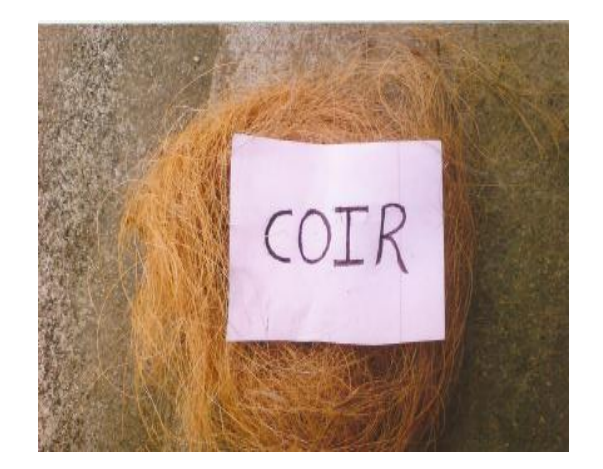
Fig 2.1 coir fiber