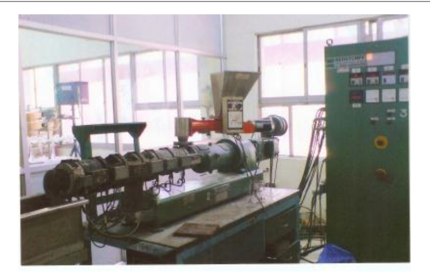
Fig 7.1 extruder machine