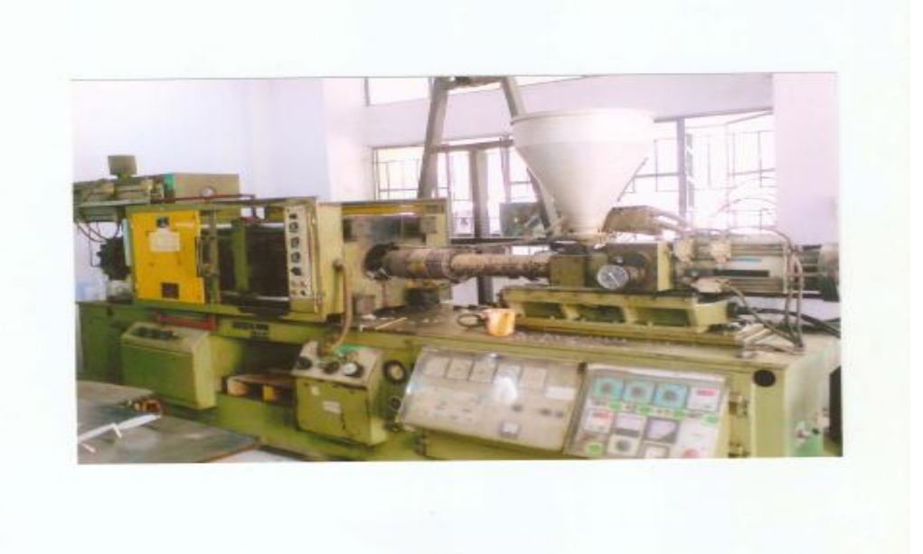
Fig 7.2 injection moulding

The outcome of material is tested for various properties such as tensile, flexural, impact and hardness in the strength of materials laboratory. The outcome material dimension is 15*20*3mm. The output specimen is immersed on the ground water for 24hours.