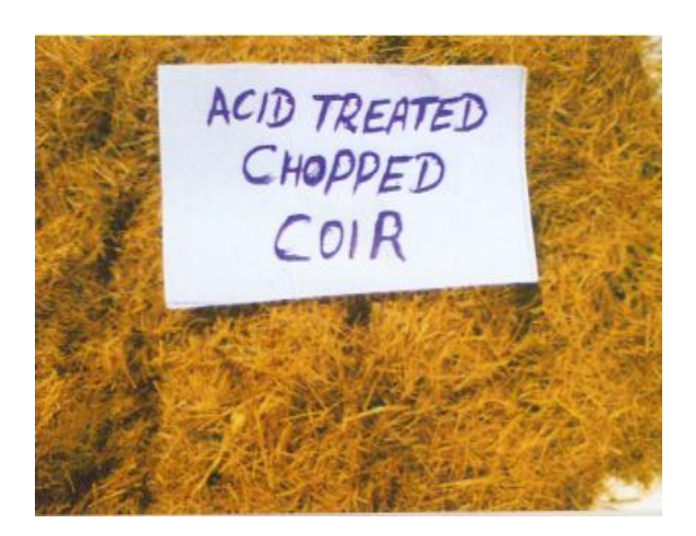
Fig 4.1 acid treated coir fiber