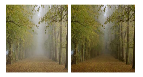
Fig2. (a) with haze image (b) Without haze image

1. Multiple image dehazing method :- During this particular haze elimination method, multiple or several images of the same scene will be taken. This process acknowledges well- known variables and avoids the unknowns. This method belongs to the category are discussed below: