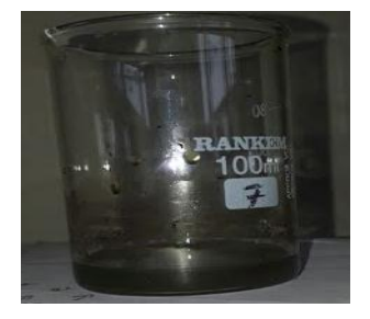
Figure 3 : Sedimentation test of Copper Oxide nanofluid.

Stability test of copper oxide nanofluid has been done manually. The as prepared Nanofluid is kept undisturbed for 50 days. Periodic observation has been done. During first 20 days it has been found that there is no physical change observed in nanofluid. Some amount of nanoparticle has been settled after 50 days has been observed. This may be because of high density of copper nanoparticle .Ideal nanofluid can been obtained when the nanofluid is stable for long period of times.