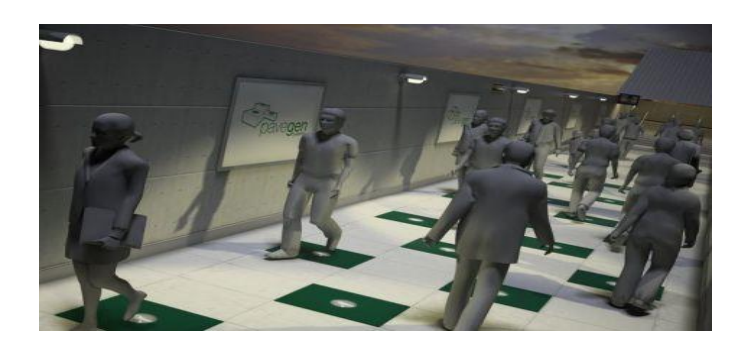
Fig -1: Power Generation Using Foot Step Method

In this electric power is generated as non-conventional method. Thus the generation of power is by walking or running on foot step. At this time non-conventional energy is very important. This system introduces power generation using non-conventional energy which does not need any input to generate electrical output. In this conversion of force energy into electrical energy takes place. This technology is based on principle of piezoelectric effect which has ability to build up electrical charge from pressure and strain applied to them. Piezoelectric ceramics belongs to the group of ferroelectric materials. These materials are the crystals and they do not need electric field being applied.